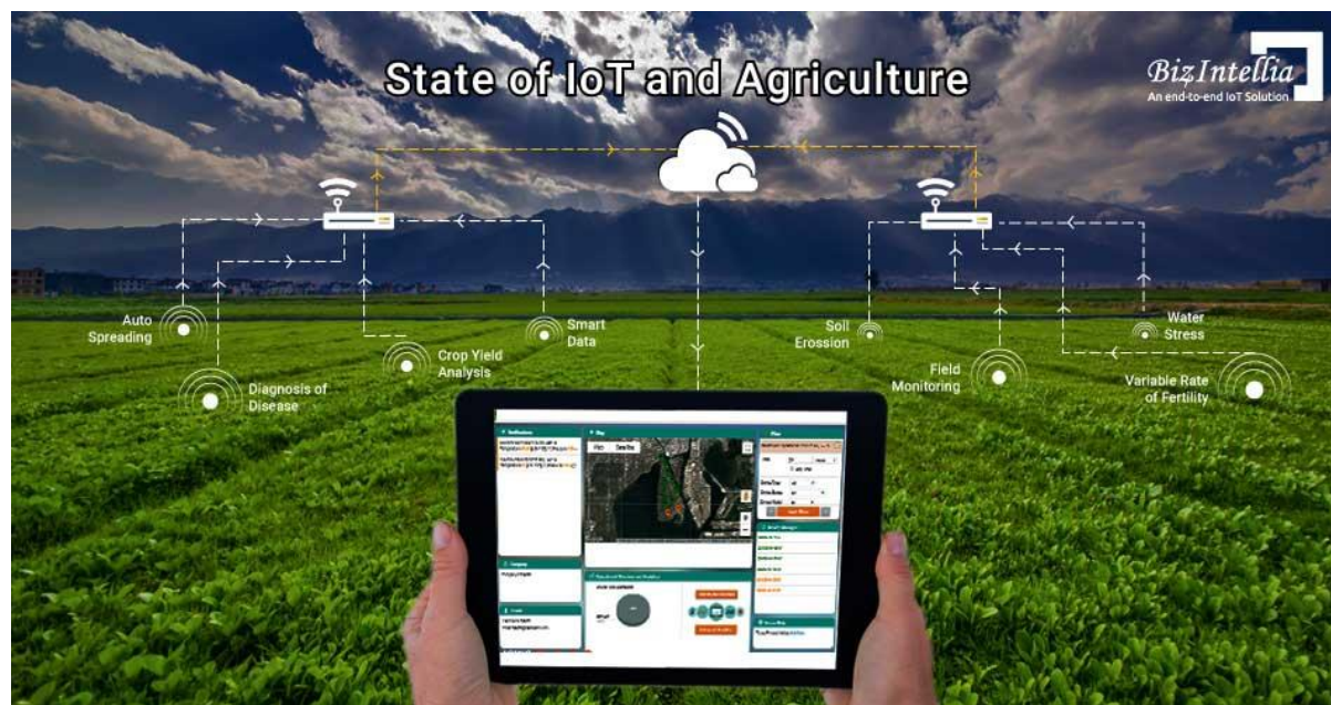
Fig 1: Field Monitoring Analysis